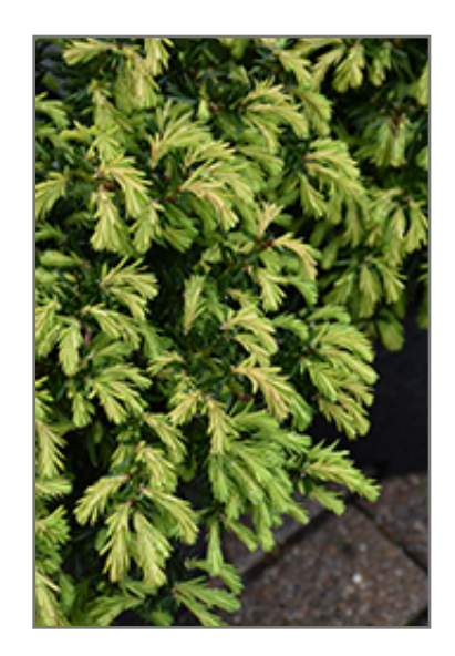
Everlow Yew foliage