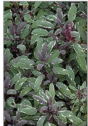
Tricolor Sage foliage