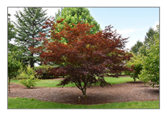
Crimson Prince Japanese Maple