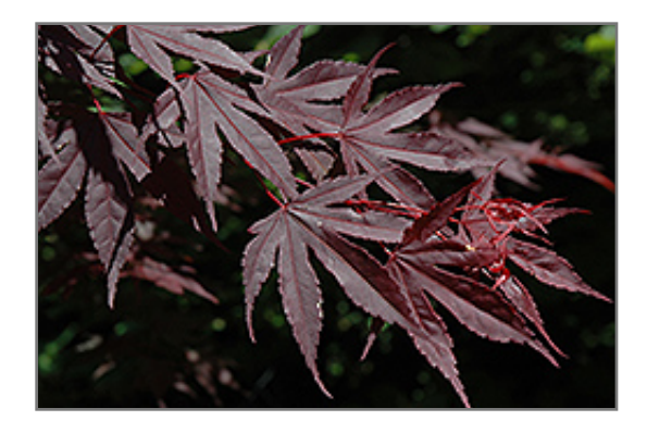
Crimson Prince Japanese Maple foliage