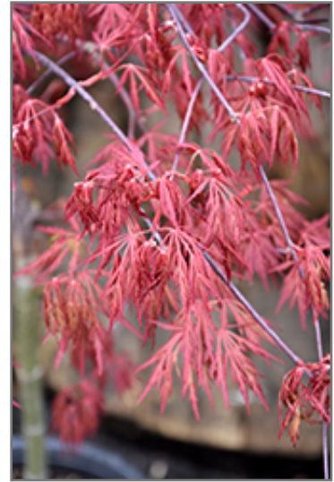
Orangeola Cutleaf Japanese Maple foliage

Orangeola Cutleaf Japanese Maple is a fine choice for the yard, but it is also a good selection for planting in outdoor pots and containers. Because of its height, it is often used as a 'thriller' in the 'spiller-thriller-filler' container combination; plant it near the center of the pot, surrounded by smaller plants and those that spill over the edges. It is even sizeable enough that it can be grown alone in a suitable container. Note that when grown in a container, it may not perform exactly as indicated on the tag - this is to be expected. Also note that when growing plants in outdoor containers and baskets, they may require more frequent waterings than they would in the yard or garden.