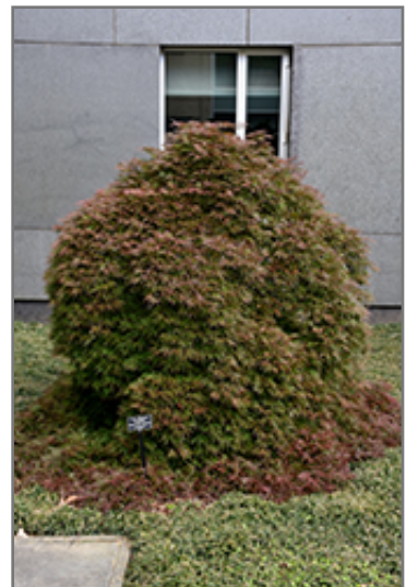
Orangeola Cutleaf Japanese Maple