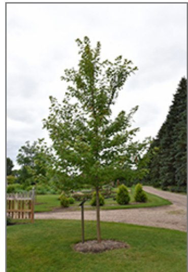
Matador Maple