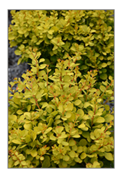
Golden Devine Dwarf Japanese Barberry foliage