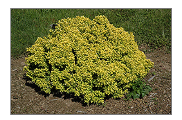
Golden Devine Dwarf Japanese Barberry