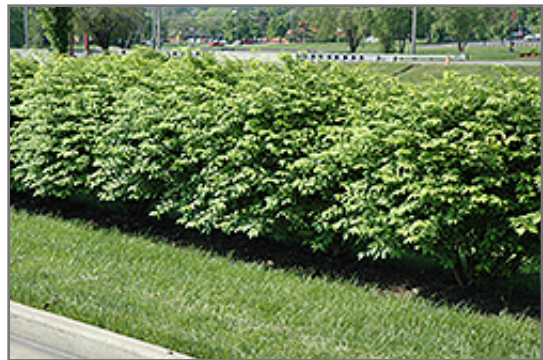
Cole's Compact Burning Bush