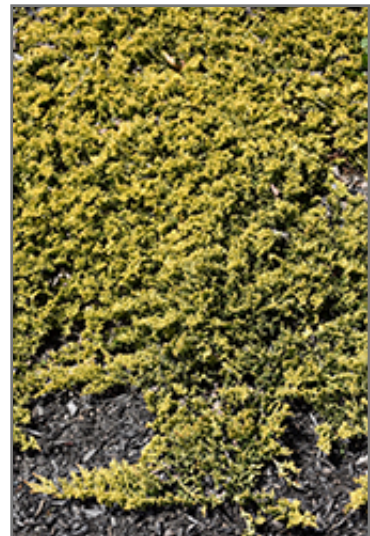
Mother Lode Juniper foliage