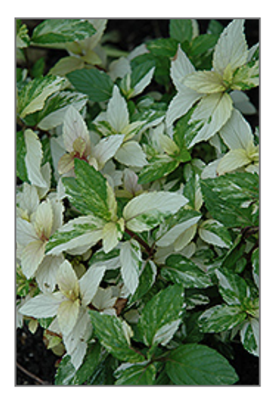
Variegated Peppermint foliage