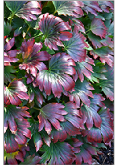
Crimson Fans Mukdenia foliage

Crimson Fans Mukdenia is recommended for the following landscape applications;