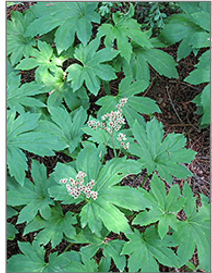
Crimson Fans Mukdenia flowers

Crimson Fans Mukdenia is a fine choice for the garden, but it is also a good selection for planting in outdoor pots and containers. It is often used as a 'filler' in the 'spiller-thriller-filler' container combination, providing a mass of flowers and foliage against which the larger thriller plants stand out. Note that when growing plants in outdoor containers and baskets, they may require more frequent waterings than they would in the yard or garden.