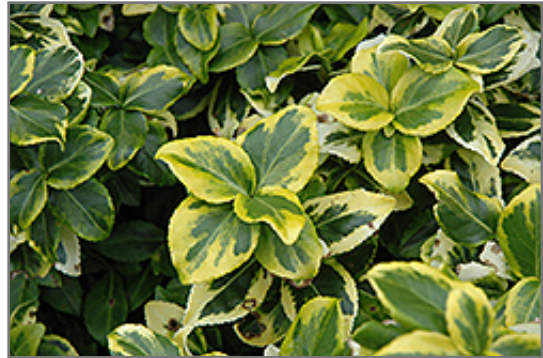
Gold Prince Wintercreeper foliage