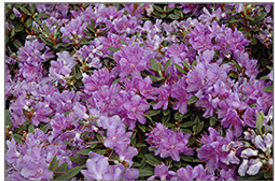
Purple Gem Rhododendron flowers