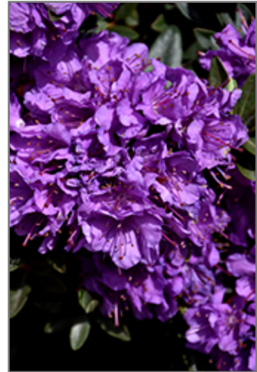
Purple Gem Rhododendron flowers