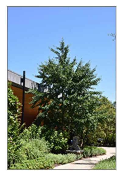
Autumn Gold Ginkgo