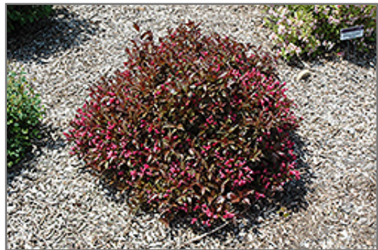
Shining Sensation Weigela in bloom