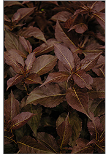
Shining Sensation Weigela foliage

This shrub should only be grown in full sunlight. It prefers to grow in average to moist conditions, and shouldn't be allowed to dry out. It is not particular as to soil type or pH. It is highly tolerant of urban pollution and will even thrive in inner city environments. This is a selected variety of a species not originally from North America.