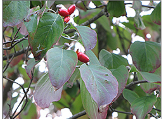
Cherokee Chief Flowering Dogwood fruit

This tree does best in full sun to partial shade. You may want to keep it away from hot, dry locations that receive direct afternoon sun or which get reflected sunlight, such as against the south side of a white wall. It requires an evenly moist well-drained soil for optimal growth, but will die in standing water. It is very fussy about its soil conditions and must have rich, acidic soils to ensure success, and is subject to chlorosis (yellowing) of the foliage in alkaline soils. It is quite intolerant of urban pollution, therefore inner city or urban streetside plantings are best avoided, and will benefit from being planted in a relatively sheltered location. Consider applying a thick mulch around the root zone in winter to protect it in exposed locations or colder microclimates. This is a selection of a native North American species.