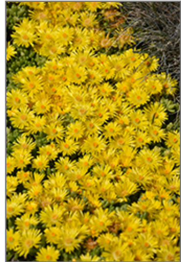
Yellow Ice Plant flowers

Yellow Ice Plant is recommended for the following landscape applications;