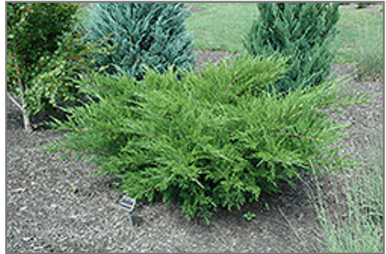
Sea Green Juniper

Sea Green Juniper is recommended for the following landscape applications;