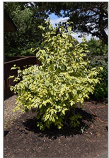
Hedgerows Gold Variegated Red-Twig Dogwood