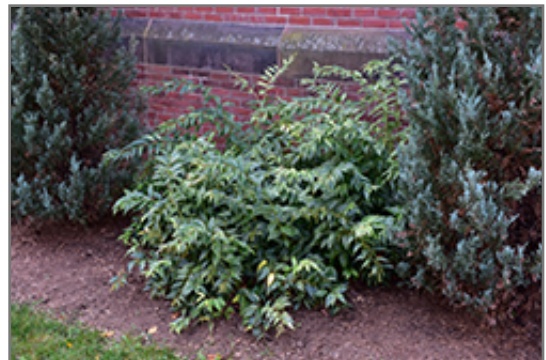
Rainbow Fetterbush