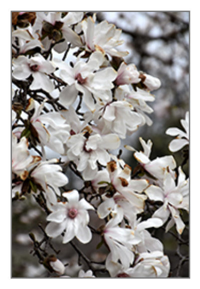
Merrill Magnolia flowers

This tree does best in full sun to partial shade. It requires an evenly moist well-drained soil for optimal growth, but will die in standing water. It is not particular as to soil type, but has a definite preference for acidic soils. It is quite intolerant of urban pollution, therefore inner city or urban streetside plantings are best avoided. Consider applying a thick mulch around the root zone in winter to protect it in exposed locations or colder microclimates. This particular variety is an interspecific hybrid.