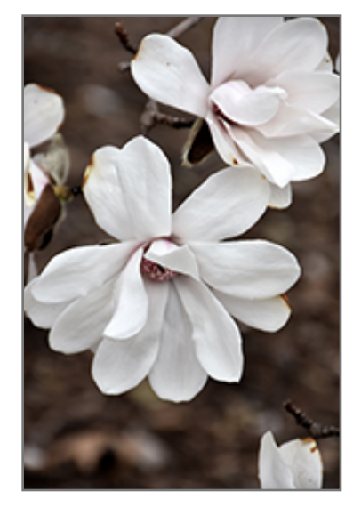
Merrill Magnolia flowers