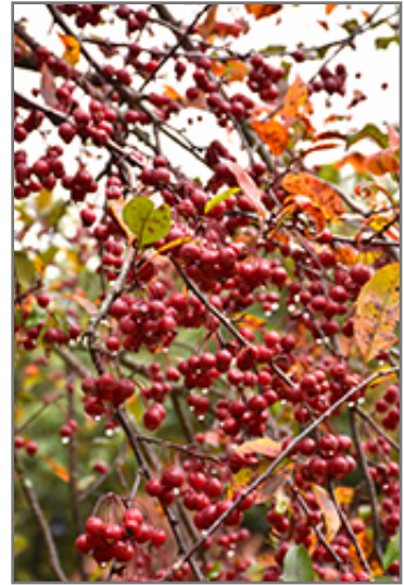
Prairifire Flowering Crab fruit

This tree should only be grown in full sunlight. It prefers to grow in average to moist conditions, and shouldn't be allowed to dry out. It is not particular as to soil type or pH. It is highly tolerant of urban pollution and will even thrive in inner city environments. This particular variety is an interspecific hybrid.