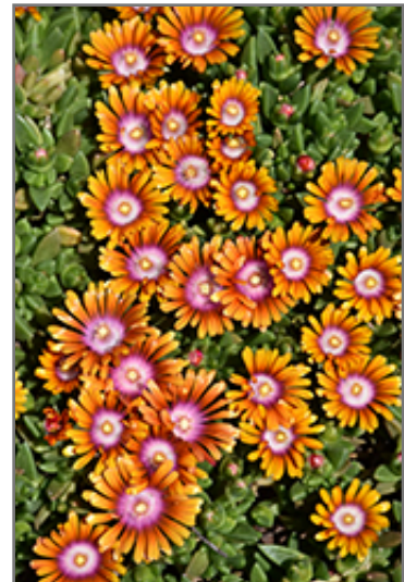
Fire Spinner Ice Plant flowers