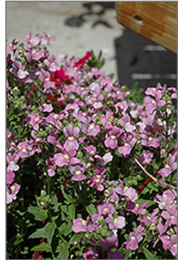
Compact Pink Innocence Nemesia flowers