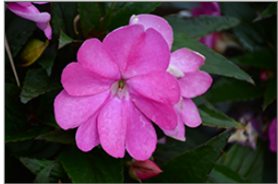
SunPatiens Compact Lilac New Guinea Impatiens flowers