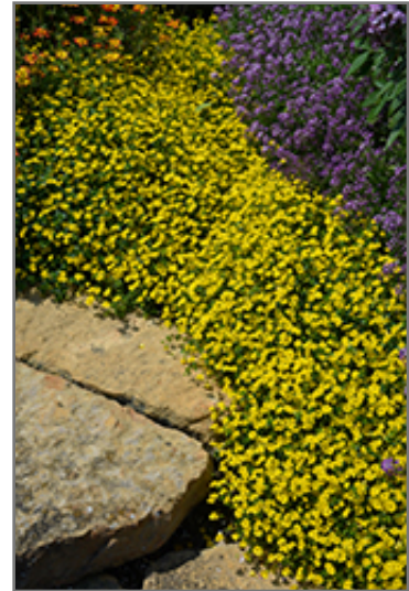
Gold Dust Mecardonia in bloom