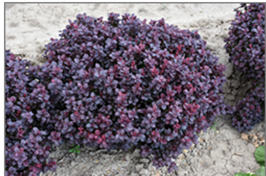
Concorde Japanese Barberry