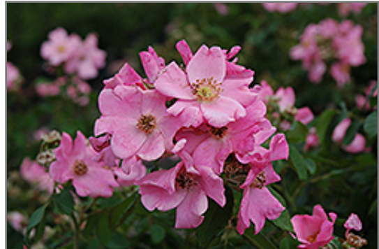
Polar Joy Rose flowers

Polar Joy Rose is recommended for the following landscape applications;