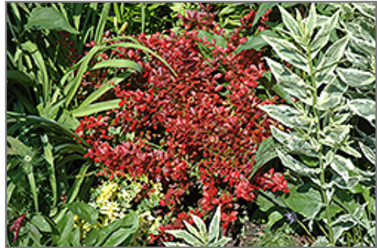
Cherry Bomb Japanese Barberry

Cherry Bomb Japanese Barberry is recommended for the following landscape applications;