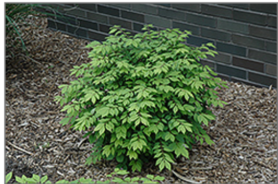
Little Moses Burning Bush